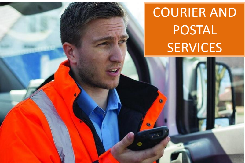
COURIER AND POSTAL SERVICES